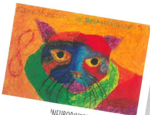
'NEURODIVERSITY IS BEAUTIFUL! Showing the spectrum of autism through colour using oil pastels.

Art has helped me cope with with things which made me very anxious and upset. Art keeps me going, it is both a distraction and a therapy. It keeps me calm. I work once a week with a very cool PhD student to help her understand why artists with a learning disability are ignored in the mainstream art world. Through this project, I have been able to work with the Wellcome gallery in London and the Scottish Sculpture Workshop.